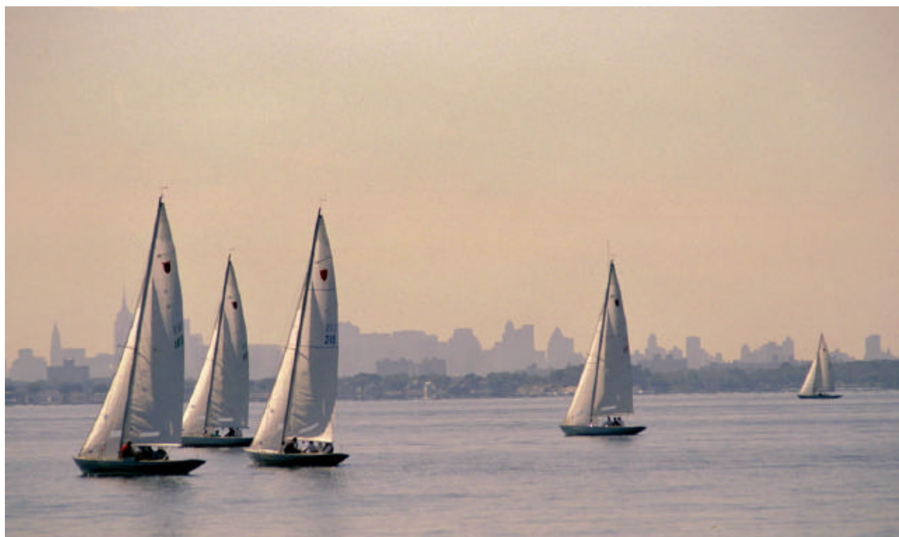
Light air tested competitors on day 2 of the 2000 Nationals. Yes, that's the New York City skyline in the background.