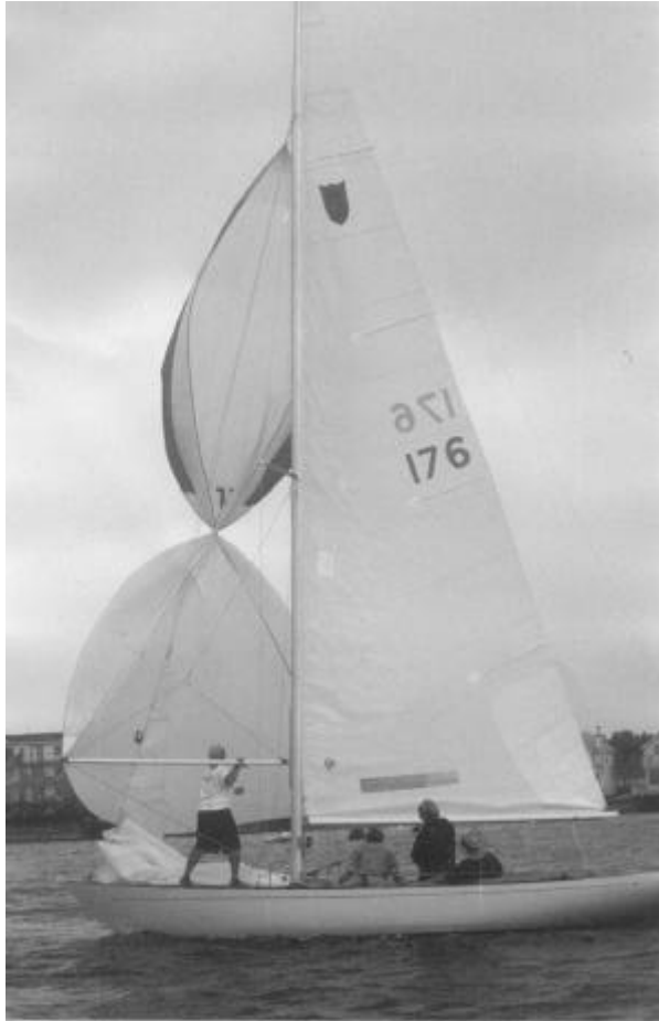
“Made!! Sort of.”

Labor Day weekend in Newport harbor is a mess. Boats of all kinds, from runabouts to 200-foot Feadships, are everywhere. To deepen the chaos, Fleet 9 sails in the Candy Store Cup.