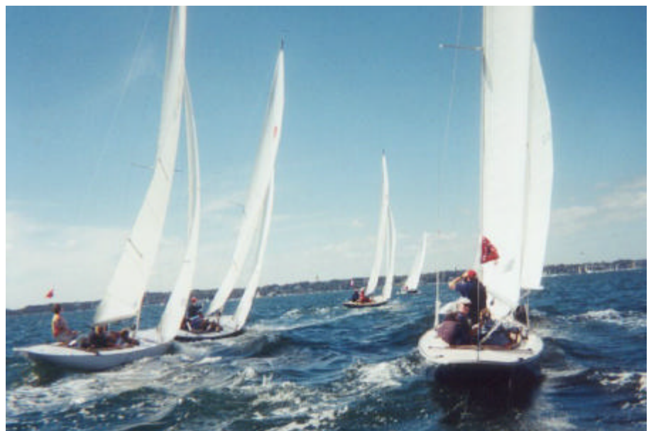
Royal St. George YC (IRE) leading Ida Lewis YC at the 2000 Patriot's Cup in Newport